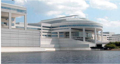
EXTANT Claims and Litigation Management, Inc.